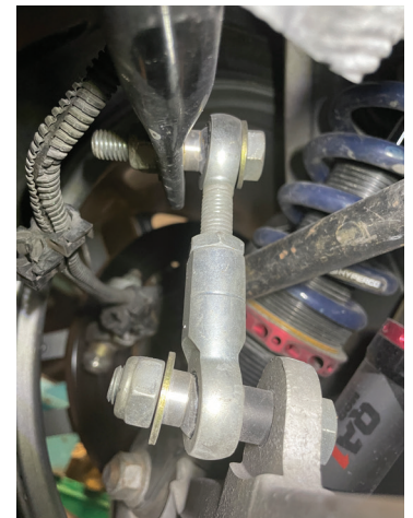
Endlink Orientation. Your spacers may differ.