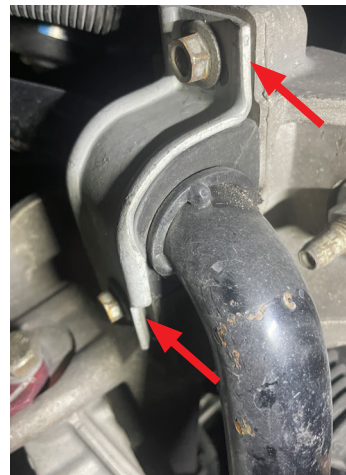
Provided washers go between the bracket and the cradle.