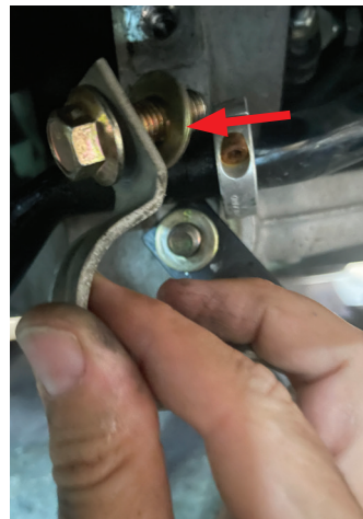
Provided washers go between the bracket and the cradle.