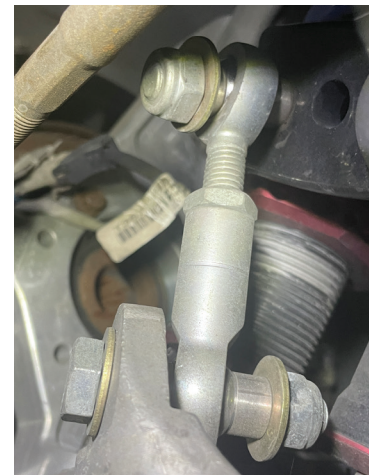
Endlink Orientation. Your spacers may differ.