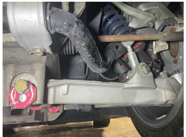
Sway Bar Orientation. End of bar goes under tie rods.