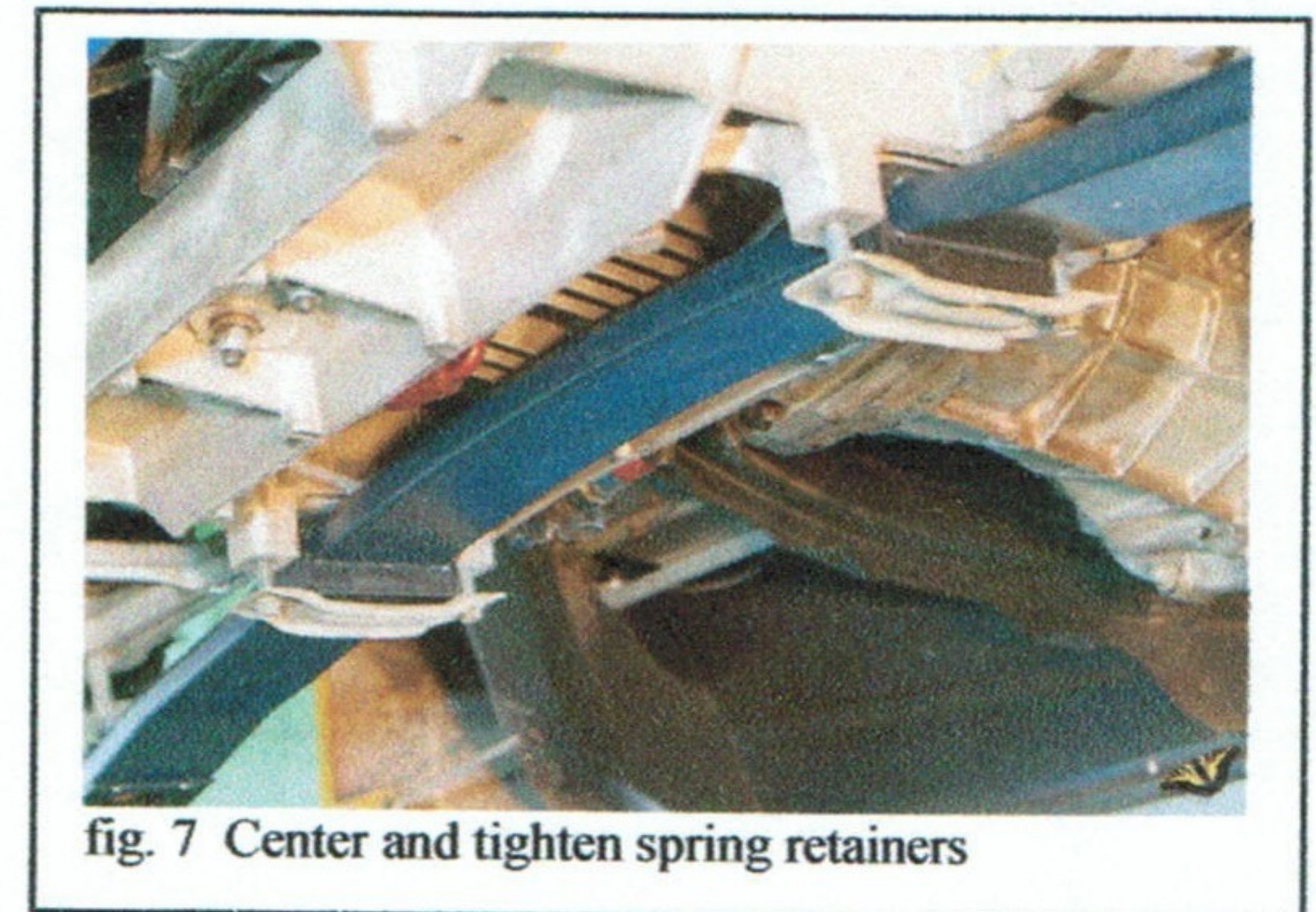
fig. 7 Center and tighten spring retainers