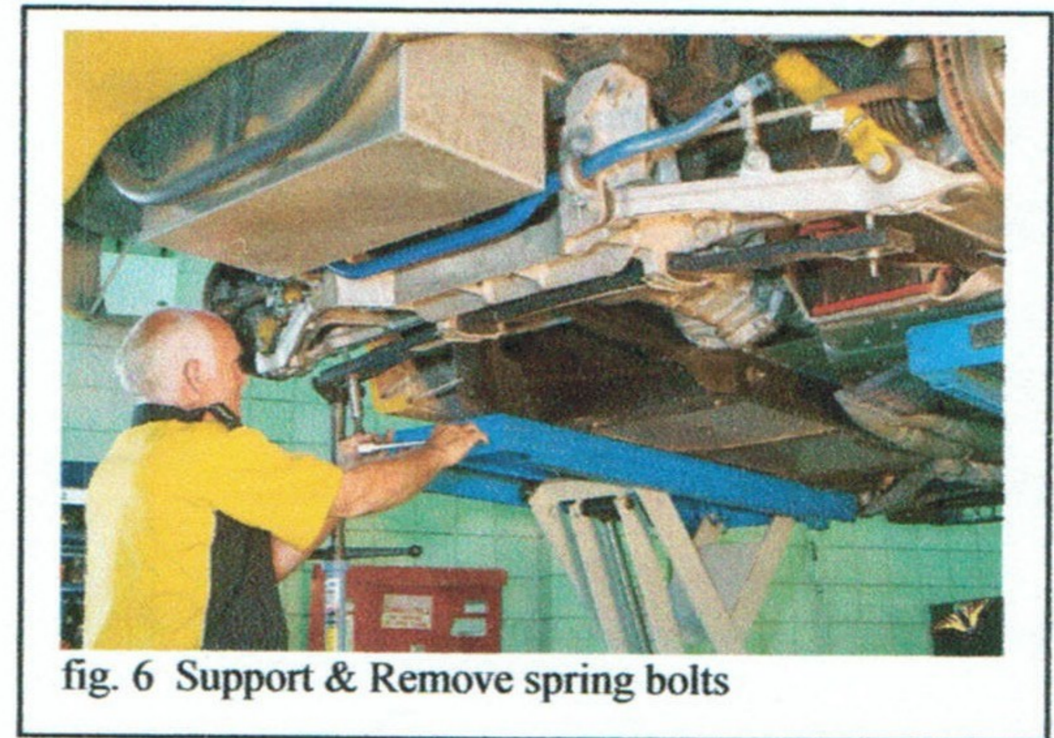
fig. 6 Support & Remove spring bolts

You are now ready to install your new rear spring.