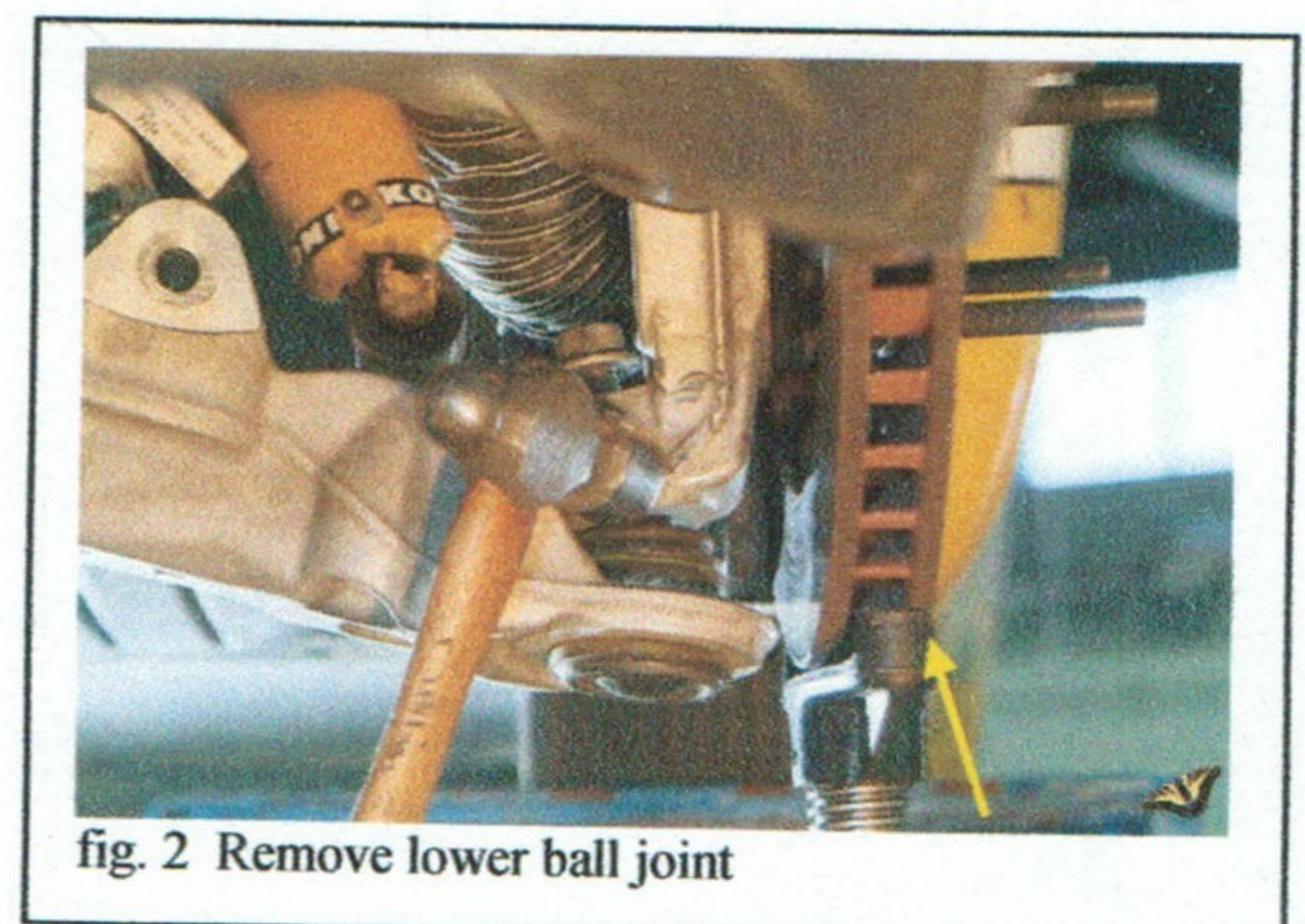
fig. 2 Remove lower ball joint