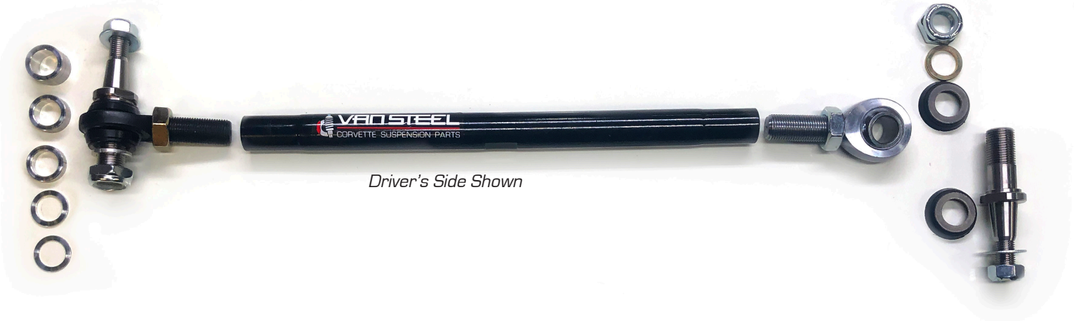
Driver's Side Shown