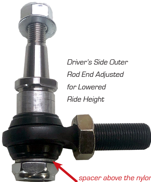
Driver's Side Outer Rod End Adjusted for Lowered Ride Height