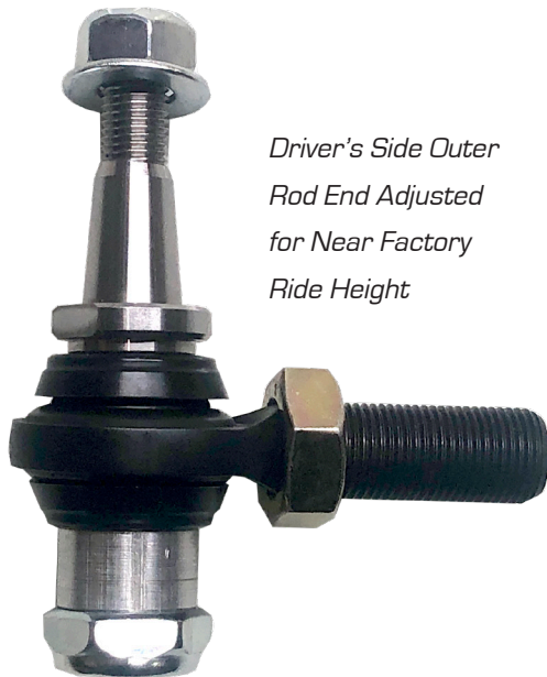
Driver's Side Outer Rod End Adjusted for Near Factory Ride Height