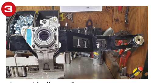
shown with offset trailing arm