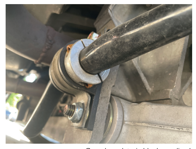
Sway bar plate is black anodized.